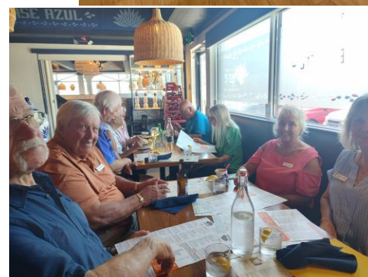
Fun times with the Cape Coral Social Club